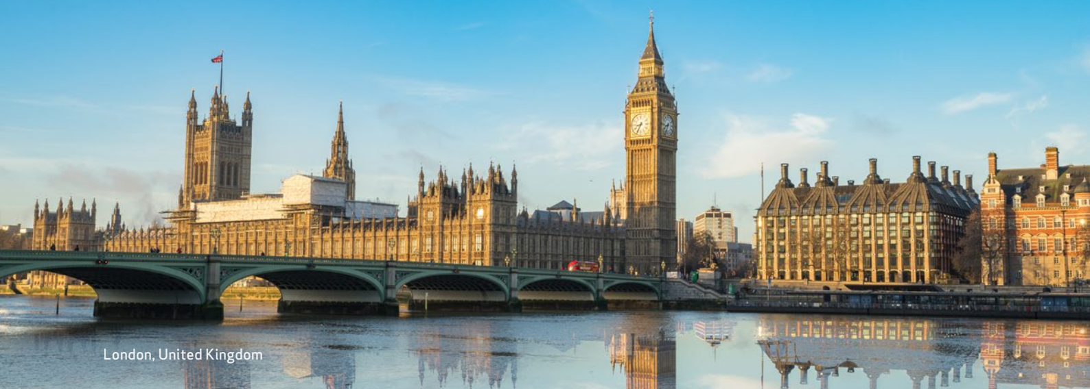
London, United Kingdom

Underlying EBITDA and EBITDA from continuing operations for the six-month period was $15.6 million and $12.7 million respectively, compared to losses in the prior corresponding period. The earnings improvement is a direct result of growing revenues, focused cost control during a period of business recovery, and Helloworld's continued investment in technology, while maintaining strong service to our customers.