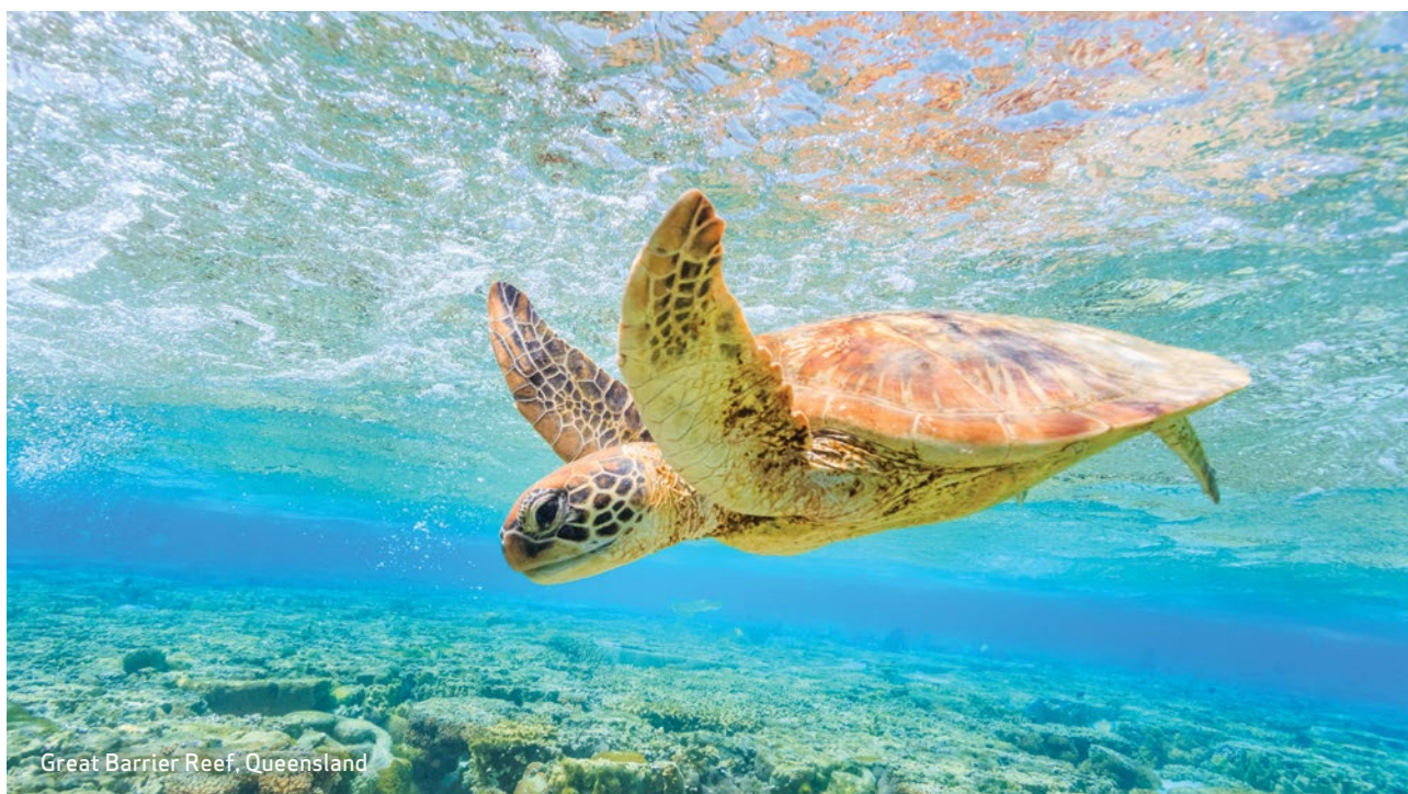
Great Barrier Reef, Queensland